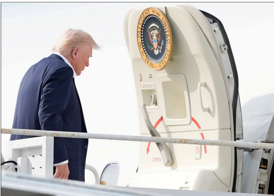
President Donald Trump boards Air Force One at Palm Beach International Airport, Sunday, May 4, 2025, in West Palm Beach, Fla.

he’d come up with the idea because of frustrations with “radicalized judges” who have insisted those being deported receive due process. Alcatraz, he said, has long been a “symbol of law and order. You know, it’s got quite a history.” A spokesperson for the Bureau of Prisons said in a statement that the agency “will comply with all Presidential Orders.” The spokesperson did not immediately answer questions from The Associated Press regarding the practicality and feasibility of reopening Alcatraz or the agency’s role in the future of the former prison given the National Park Service’s control of the island. Former House Speaker Nancy Pelosi, a California Democrat whose district includes the island, questioned the feasibility of reopening the prison after so many years. “It is now a very popular national park and major tourist attraction. The President’s proposal is not a serious one,” she wrote on X. The island serves as a veritable time machine