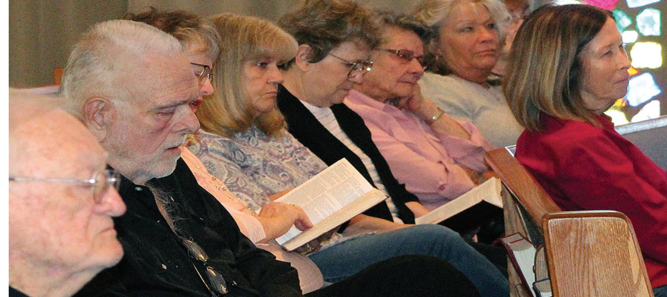
Large crowds came to Shepherdsville Christian Church for Holy Week services