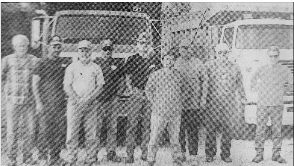
2000: Several truck drivers donated their time and vehicles recently to put gravel on the road to the soccer fields behind the Lighthouse Church. Liter's Quarry donated the gravel.