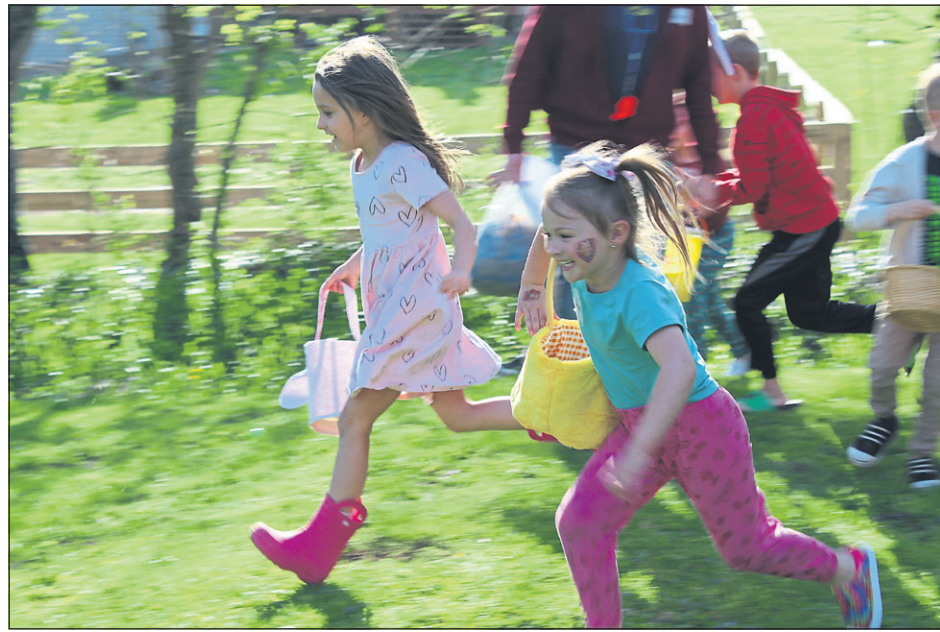
Children run to find eggs in an Easter egg hunt held at Westport Baptist Church April 16.

Enjoy arts and crafts from local artisans, as well as perennials, annuals and succulents donated by local merchants and club members. Come shop while the kiddos hang out at the petting zoo, and be sure to check out the food trucks.