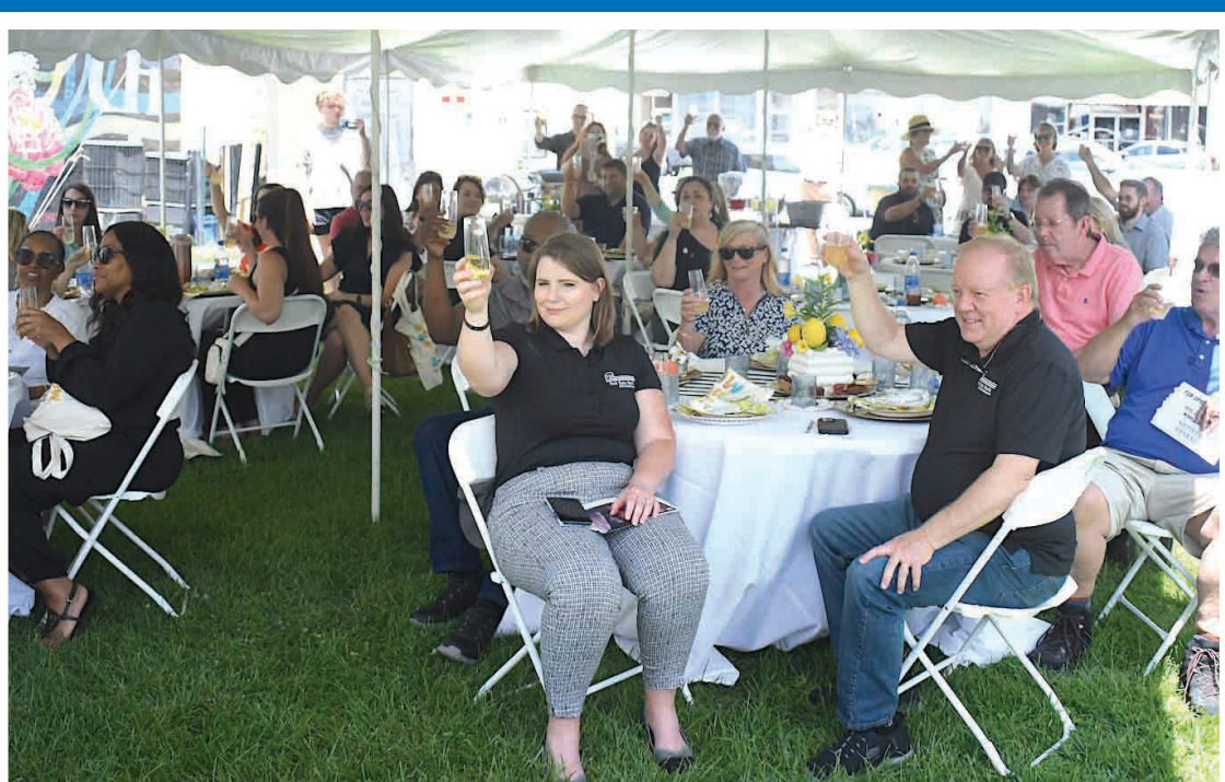
The group of sponsors and supporters gathered at Tuesday's Levitt AMP artist reveal luncheon raise their glasses to toast the lineup of artists who will be performing during this year's Middlesboro Music Series.