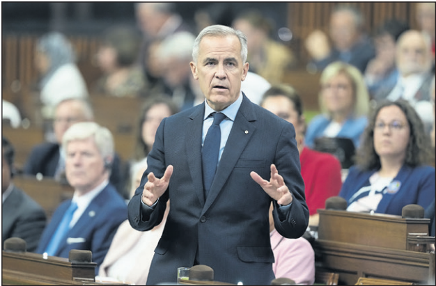
Prime Minister Mark Carney rises during Question Period on Parliament Hill in Ottawa, Canada, on Thursday.