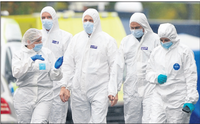
Forensic teams work at the scene of a stabbing incident that took place on Thursday, at Heaton Park Hebrew Congregation synagogue, in Manchester, England, on Friday.