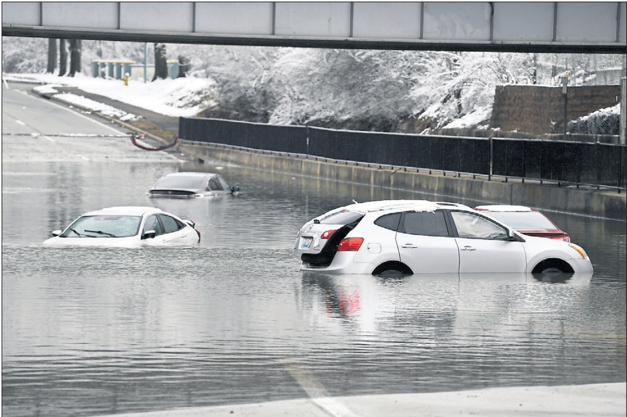
Cars sit in floodwaters at a railroad underpass in Louisville on Sunday.

rockslides happened near the Caldwell-Hopkins County line at the 87 mile marker of Interstate 69 northbound, Kentucky Transportation Cabinet District 2 reported over the weekend. Road closures were reported in all 120 counties, but areas with the most closed roads included western, southern and southeast Kentucky, the governor said. Responders continued search and rescue efforts Tuesday, and the commonwealth remained under a state of emergency. "We are still in the search and rescue phase of this emergency," Beshear said during a Monday morning news conference. "We still have multiple different missions that are underway. There are still people that are in harm's way, and it's very important today that we continue to remind folks not to drive through standing water, not to drive