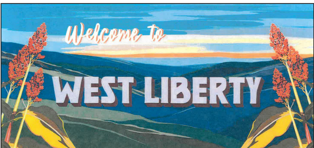
Mural design for City Hall building by artist Lacy Hale.