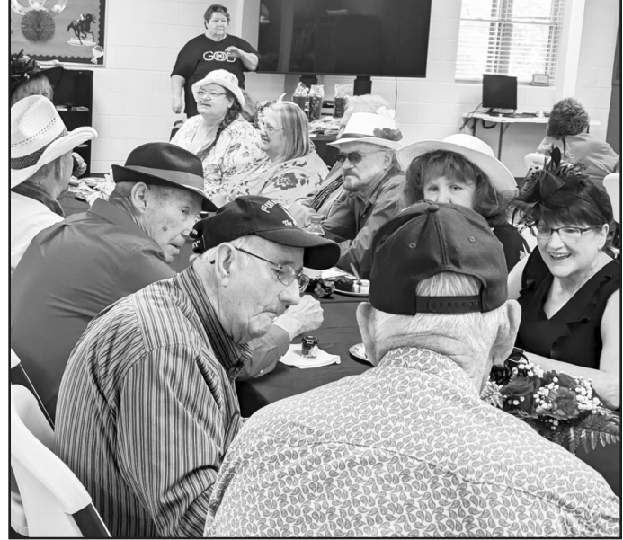
Seniors enjoy food and conversation.

"Flip the Script on Aging." Dated this second day of