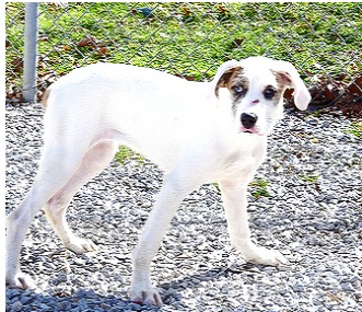
This is Denali - a 6 month old female Boston/ Aussie mix. She is a very sweet pup,

For More Information: contact the Morgan County Animal Shelter at 743-2545 or stop by. Shelter Hours are Mon., - Fri. 10:00--2:00.