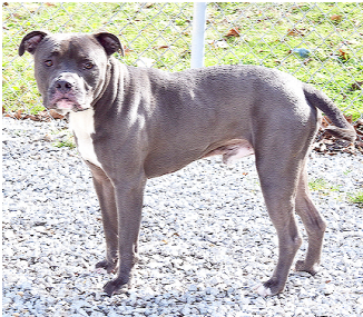
This is Judge - a 3 year old male American Bulldog. He is a sweetheart, loves to love you.