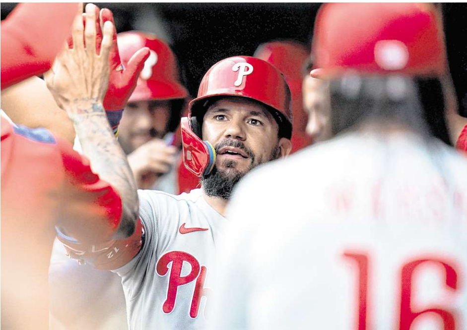
Philadelphia Phillies designated hitter Kyle Schwarber celebrates his home run – the 42nd blast of the season – with teammates in the eighth inning of Monday's 4-1 win over the Cincinnati Reds in downtown Cincinnati.