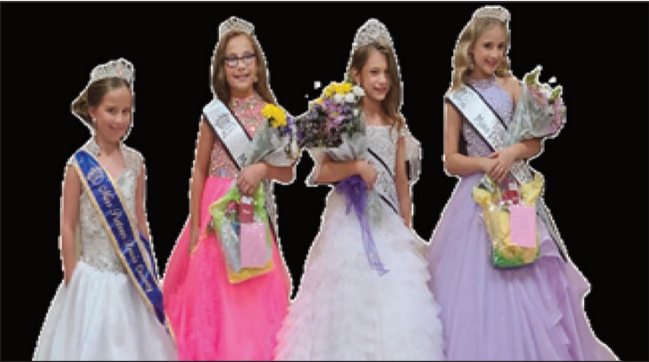
Miss Pre Teen and her Court.