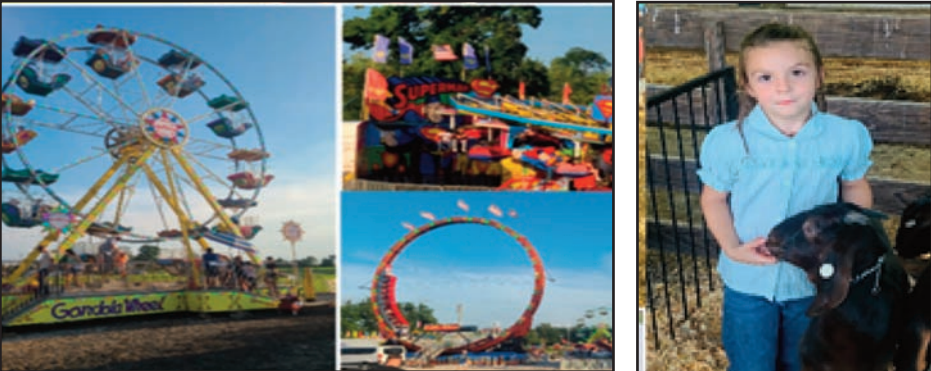
The carnival and other events at the Tollesboro Lions Club Fair.