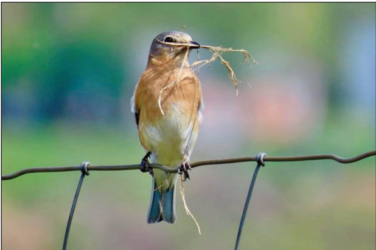
Spring is here and the female Eastern Kentucky Blue Bird is busy making her nest. They usually have two to three successful nests a year. The male is a brilliant blue and the female is a much more pale color. Be on the lookout, there are many in the area.

75¢ Volume 102 The Only Newspaper Published in Lewis County Vanceburg, Kentucky Phone 606-796-2331 TUESDAY, APRIL 15, 2025 NUMBER 2025-15