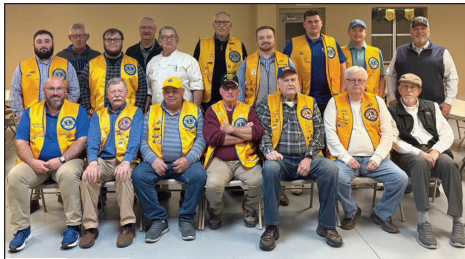
LEWIS COUNTY HERALD

Several members of the Vanceburg Lions Club were on hand for the Zone Meeting hosted by the club at the Black Oak Fire Station.