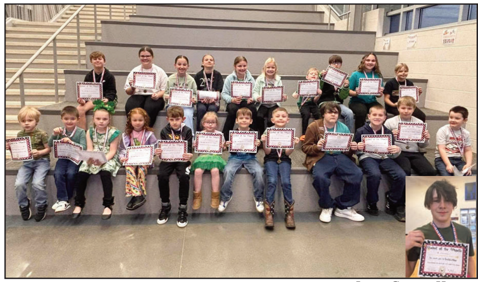
LEWIS COUNTY HERALD