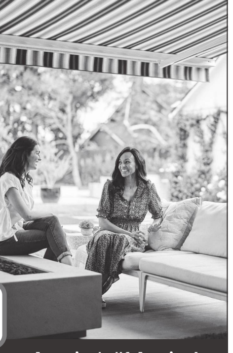
America's #1 Awning!

Call 1-855-904-6289 now to SAVE $350 TODAY!