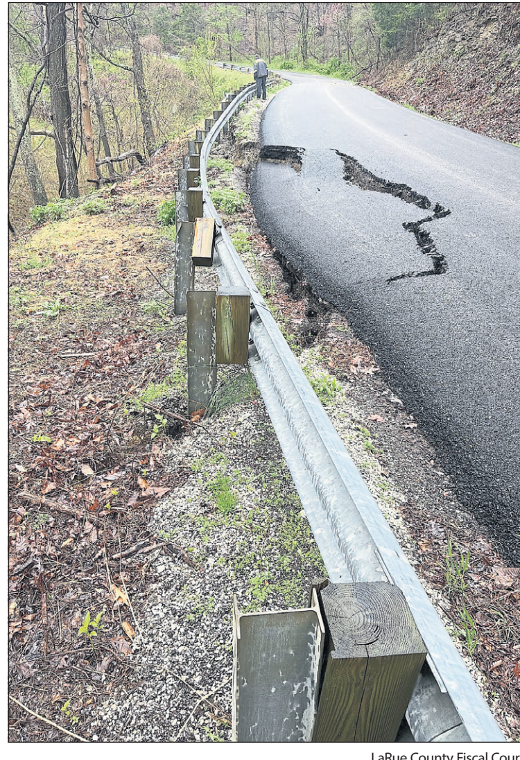
LaRue County Fiscal Court

The LaRue County Road Department has been aiding the Kentucky Transportation Cabinet to clear LaRue County's main arterial roads of flood waters. This pump unit supplied by the City of Hodgenville was able to extract 350 gallons of water per minute.