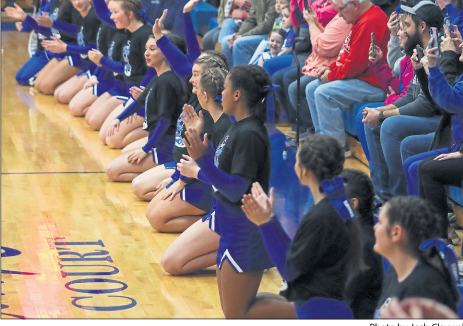
LaRue County varsity cheerleaders work with the Little Hawks cheerleading squad.