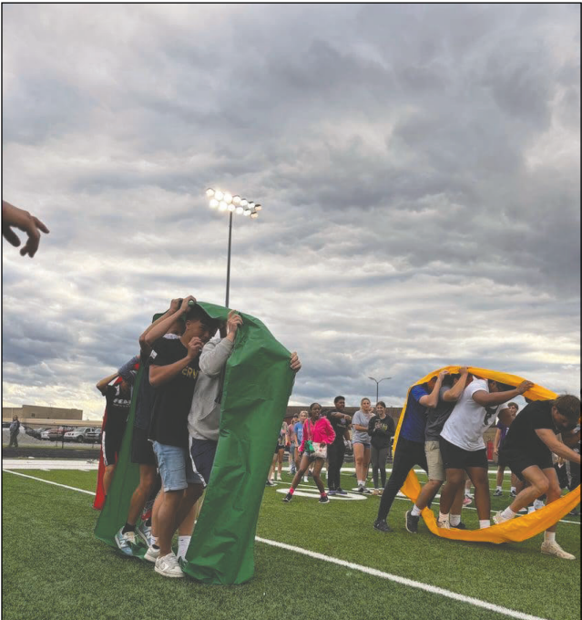
Students engaged in friendly competition during the Battle of the Schools, which is designed to promote a drug-free message through local youth.