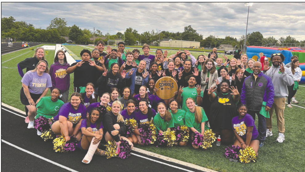
Bardstown students pose for a photo during the Battle of the Schools competition.