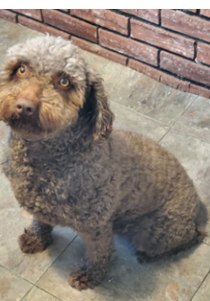
6 yr old female Spanish Water Dog

She needs a loving forever home. Lyla is in need of a new home because the owner has some health issues and is no longer able to care for her.