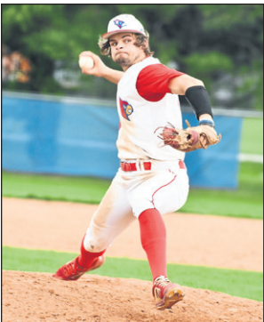
Cardinals rout rival Eagles >>SPORTS B1