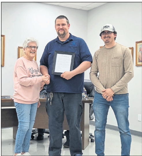
New Haven Mayor Linda Mattingly recognized the dedication and hard work of the Rolling Fork Fire Department during last week's Board of Commissioners meeting.