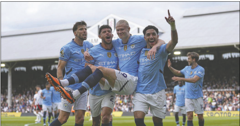
Manchester City players celebrate after Manchester City's Erling Haaland, center, scored his side's second goal during the English Premier League soccer match between Fulham and Manchester City at Craven Cottage, London, May 25