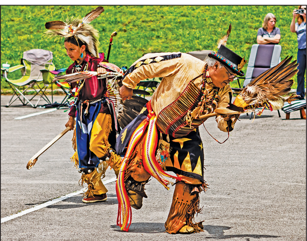
The Pueblo Enchantment Dancers, who entertained the crowd with their authentic dancing during last year's Native Dawn Flute Gathering, are returning for this year's festival.