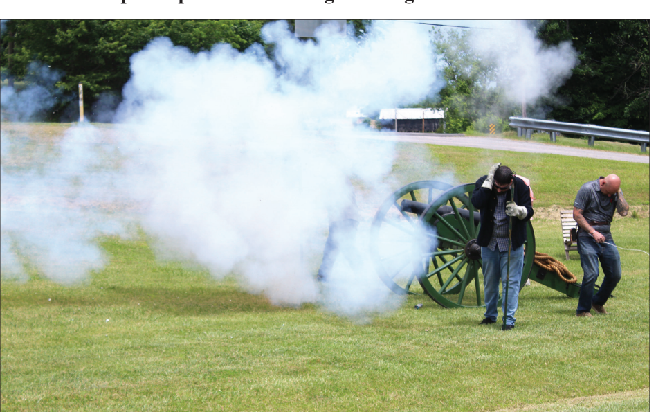
The Glover's Station Reenactment Artillery crew fired the cannon, paying tribute to those Green Countians who sacrificed their lives in past wars/ conflicts defending our freedom.