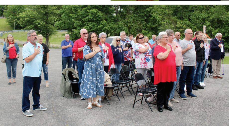
The audience participated in the Pledge of Allegiance.