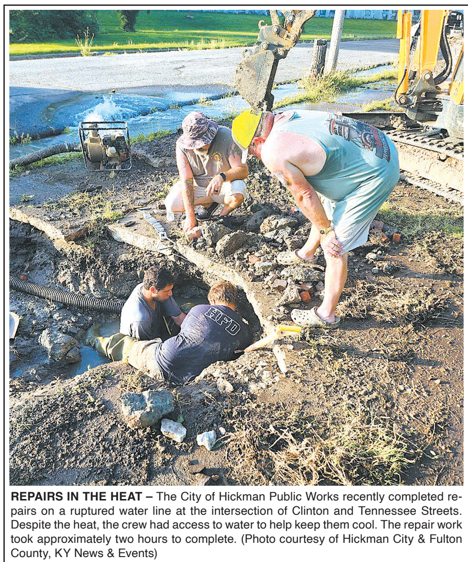
REPAIRS IN THE HEAT – The City of Hickman Public Works recently completed repairs on a ruptured water line at the intersection of Clinton and Tennessee Streets. Despite the heat, the crew had access to water to help keep them cool. The repair work took approximately two hours to complete.