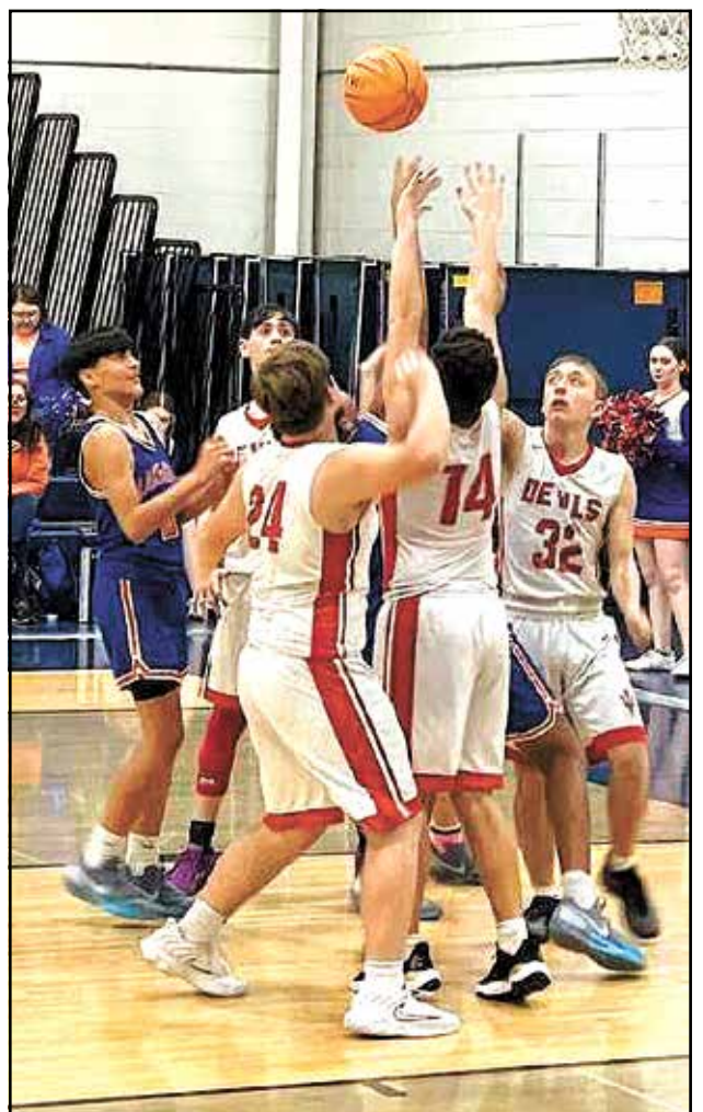
INTER-COUNTY CONTEST – The South Fulton Middle School Red Devils basketball team battled it out with Lake Road Generals for the Area Tournament championship game Jan. 30, bringing home the championship, 40-36 Jan. 30.