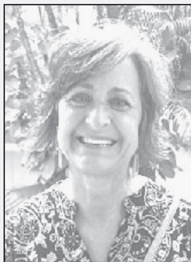
by Dawn Reed Eastern Ky. Columnist

I've got the joy, joy, joy, joy, down in my heart but it doesn't always show on my face these days. Gravity and age tug at the sides of my mouth lately causing a frown/scowl. (Try not to picture Cinderella's stepmother.)