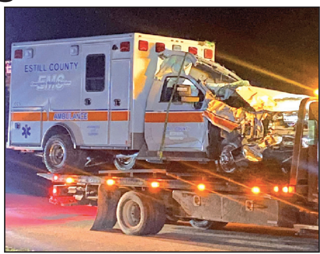
Five people were injured in March when an Estill EMS ambulance collided with a vehicle while transporting a child to UK Hospital. The child was not injured. File photo