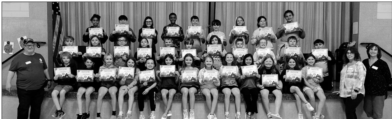
Westside students celebrate B.U.G. with a pizza party hosted by the Kiwanis Club of Cynthiana.