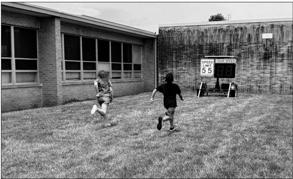
Harrison County Schools