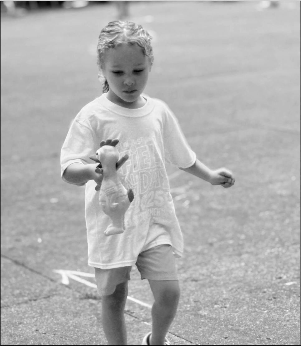
Harrison County Schools