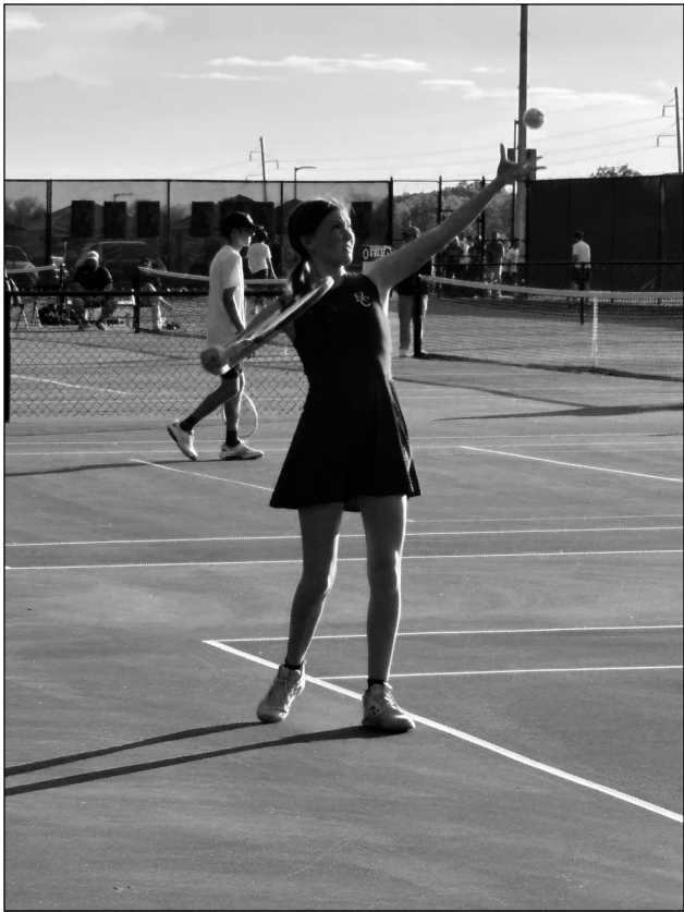
Harrison County Schools