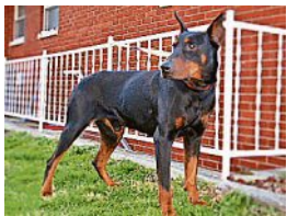
DOBERMAN PINSCHER PUPS AKC CALLS ONLY 606-878-6395