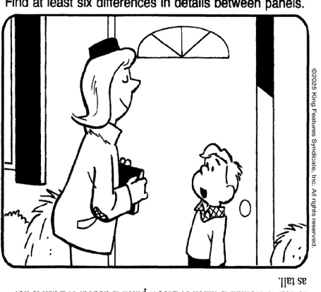
lower, 4. Woman is taller, 5. Elbow patch is added, 6. Bush is not Differences: I. Boy is moved, 2. Sweater is shorter, 3. Window is