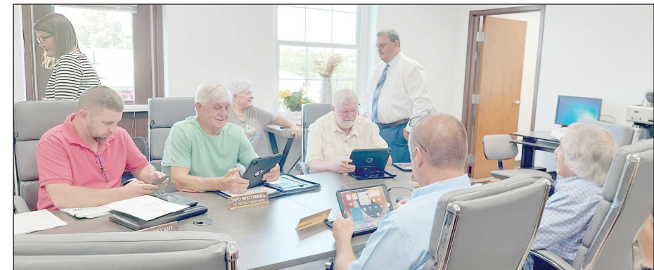
Fiscal Court was held downstairs in the conference room.