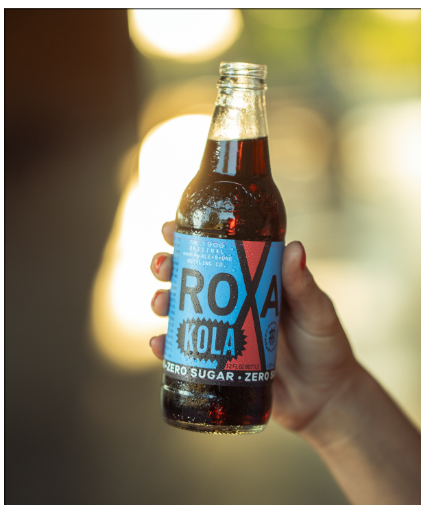
Zero Sugar Roxa Kola will arrive on store shelves later this month.

Ale-8-One is widely available in Kentucky, nationwide online, in Kroger stores throughout the Southeast, and at most Cracker Barrel Old Country Stores and at Fresh Market.