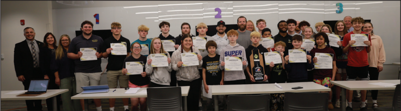
The BCHS wrestling team.