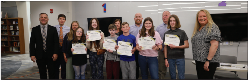
The BCMS academic team.