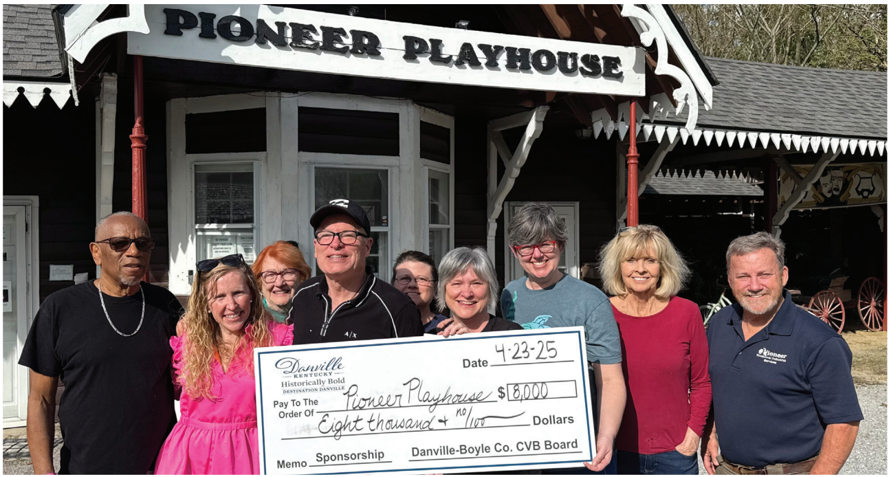
Members of the Pioneer Playhouse board accepted a check for $8,000 from the Danville-Boyle County Convention and Visitors Bureau to help advertise and market the upcoming season of performances at the playhouse, which begins June 6 and runs through Aug. 16. For more details, visit pioneerplayhouse.com . (Photo submitted)