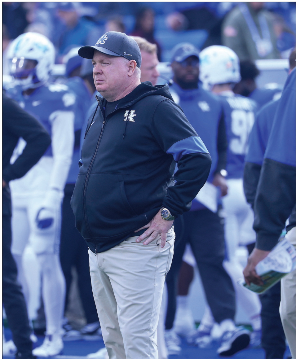
Mark Stoops knows his team has to be tougher and more disciplined next season.