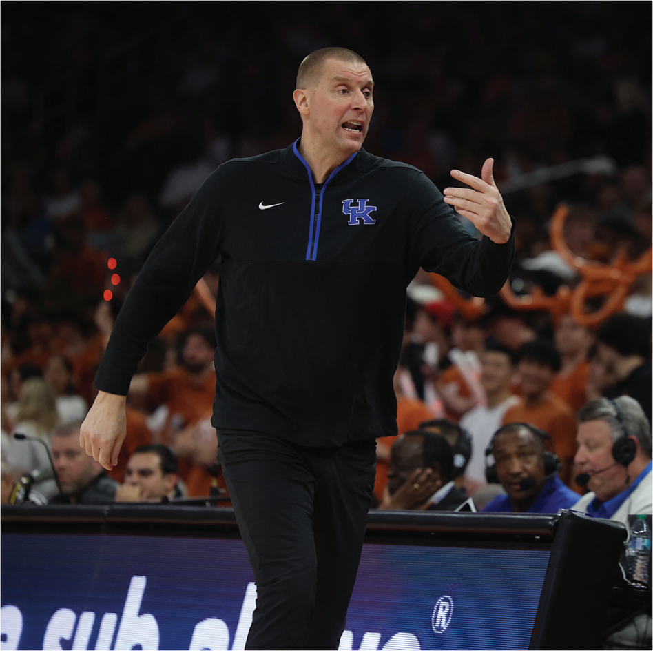
Former UK All-American Kenny Walker likes that Mark Pope was a "blue collar player" who also knows how to interact with players and fans.