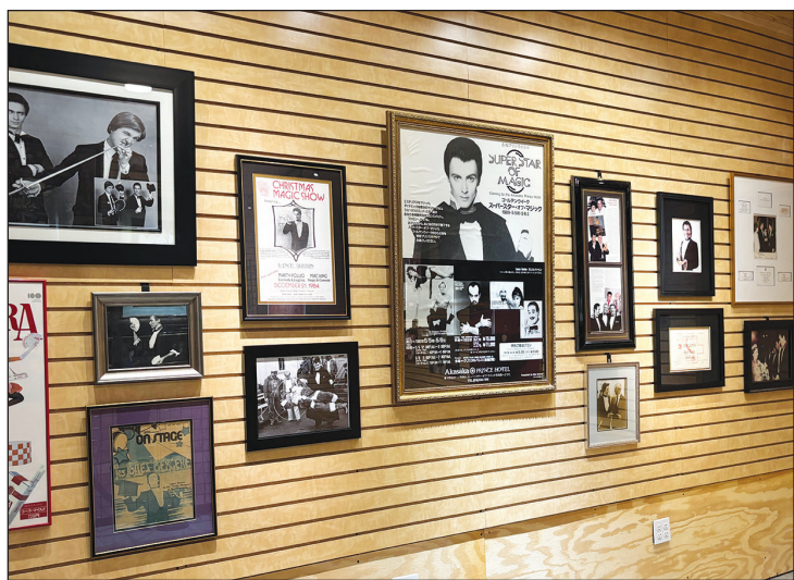
A snippet of items that will be available for viewing.