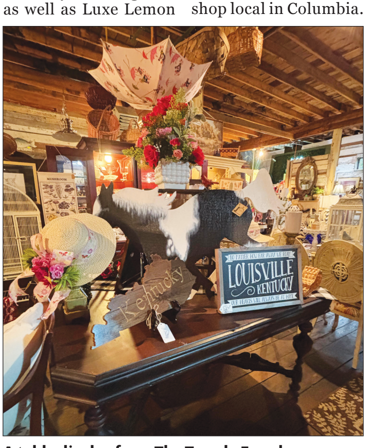
A table display from The Trendy Farmhouse.

being located at Gypsy-Handmade JoLee Wholesale. A special second event hosting several Nights" vendors was held at 313 Police Officer Travis Bell and Lance Burton for 2025 was held on Maple in conjunction Columbia Nights. Kentucky decorations, Derby food, and other items could be purchased at some shops. Multiple businesses participated and offered extended shopping hours to encourage people to