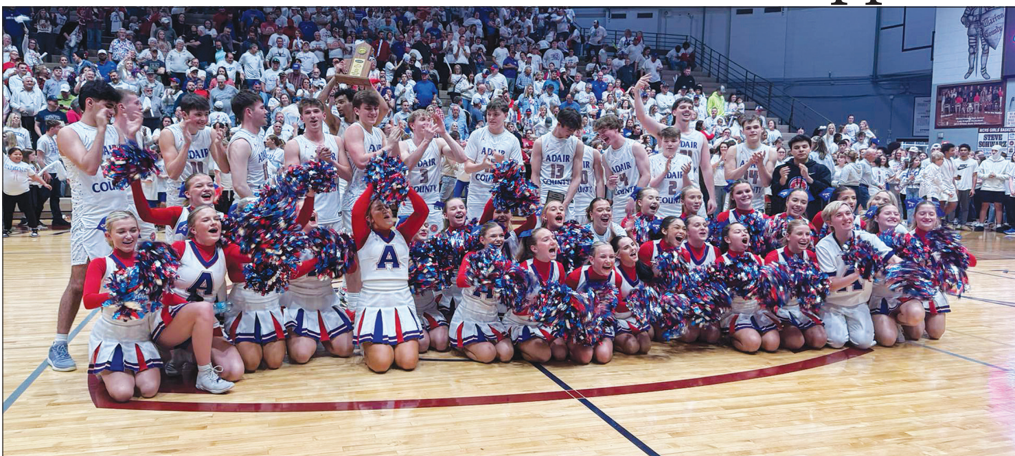
The Adair County Indians and Adair County High School Cheerleaders gather to celebrate the 5th Region win over North Hardin.

From the start, the energy in the air was palpable. The bleachers overflowed with Indian fans, the student section buzzed with excitement, and the Mini Wigwam was hyped. The nerves were high, but the players were locked in