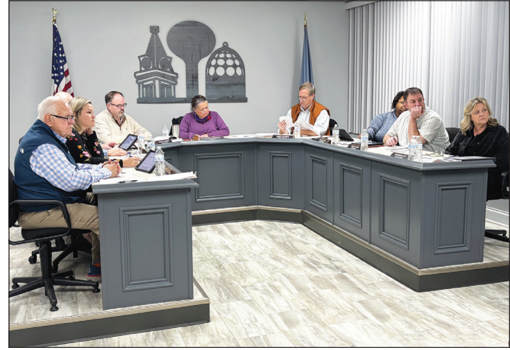
The Columbia City Council met on Monday, February 3 at 6 p.m.

cost: The Adair County Judge Executive's office, Adair County Sheriff's Office, Columbia Police Department, Adair EMS Services, North Century Pharmacy, CVS Pharmacy, Columbia Pharmacy, CertaCare Pharmacy and New Path Medical, TJ Samson Health Care in Columbia. Additional locations will be added during the month and will be listed on The Support Agency's Facebook Page. Some agencies have been given pouches for their clients and any agency in Columbia can have access to the pouches by contacting The Support Agency at lhwillkerson@thesupportagency.com . For more information, visit www.thesupportagency.com and on our Facebook Page.