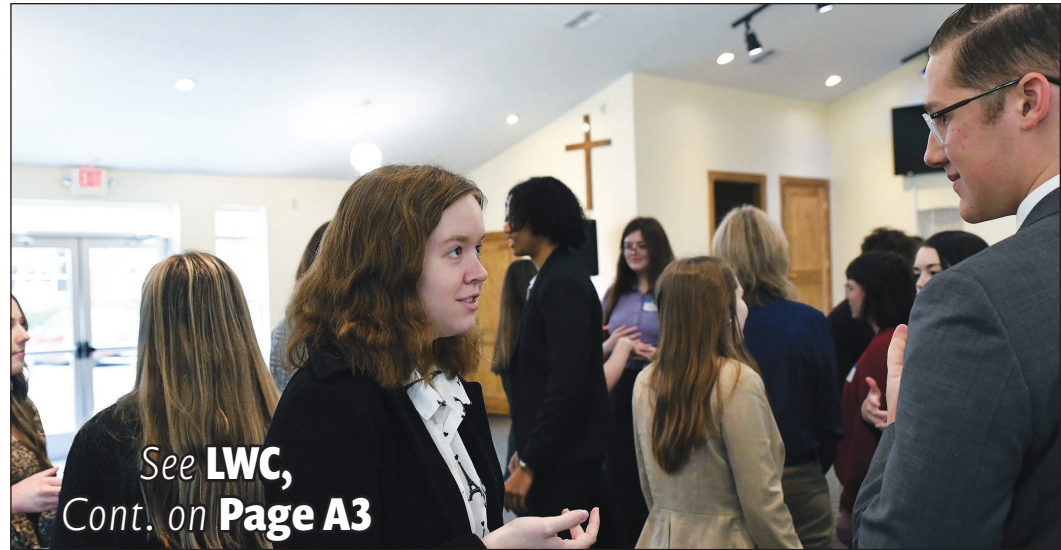
See LWC , Cont. on Page A3

High school seniors take part in an icebreaker exercise Saturday morning in the Lindsey Wilson College Norma and Glen Hodge Center for Discipleship. The students were on campus to participate in the annual Begley Scholars Day and interview for Lindsey Wilson's most prestigious scholarship, the John B. Begley Scholarship.