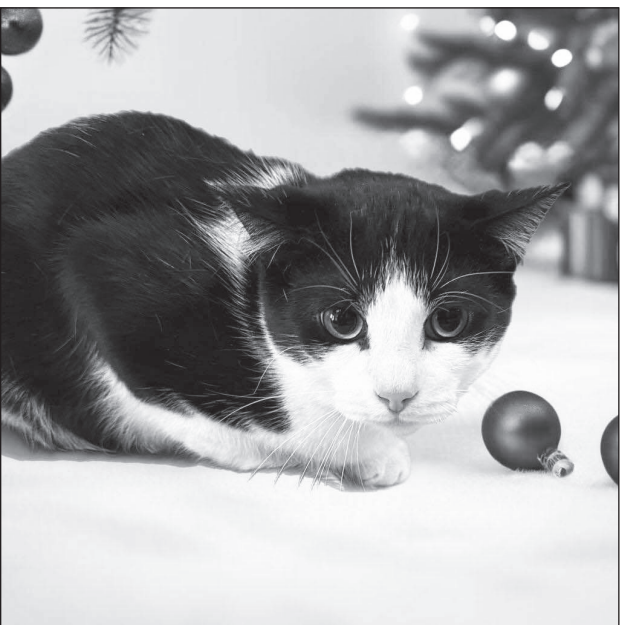
CAT OF THE WEEK: Sir Benedict is a year-old domestic shorthair. He's a sweet cat; he's a bit scared in the shelter and like most cats would do better in a quiet environment. He gets along with other cats. Dogs would need to be slowly introduced since he is scared.

Knox-Whitley Humane Association The Knox-Whitley Animal Shelter is open 11 a.m. to 4 p.m. on Tuesdays and Fridays. They are also open 10 a.m. to 2 p.m. on