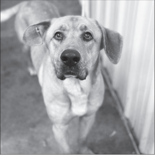
DOG OF THE WEEK: Homer is a 3-year-old lab mix. He's a really good dog. He loves people and he tested well with other dogs when he came in. He would be a great addition to pretty much any family!