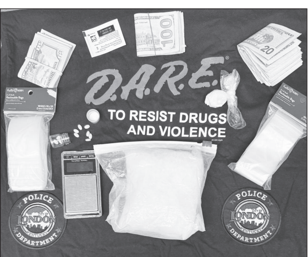
LPD officers seized a large amount of currency, suspected fentanyl, over one pound of suspected methamphetamine, and other items associated with trafficking narcotics.

“We are proud of the work we’ve done this year, from financial stability to innovative programs like the Virtual Academy,” she said.