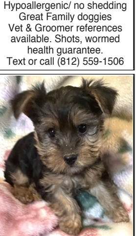
Yorkie boy ready and yorkie/poo ready for Christmas 270-230-6000

Jasper IN - Christmas Puppies Cavapoo Puppies ACA Reg. Ready By Christmas! Hypoallergenic/ no shedding Great Family doggies Vet & Groomer references available. Shots, wormed health guarantee. Text or call (812) 559-1506