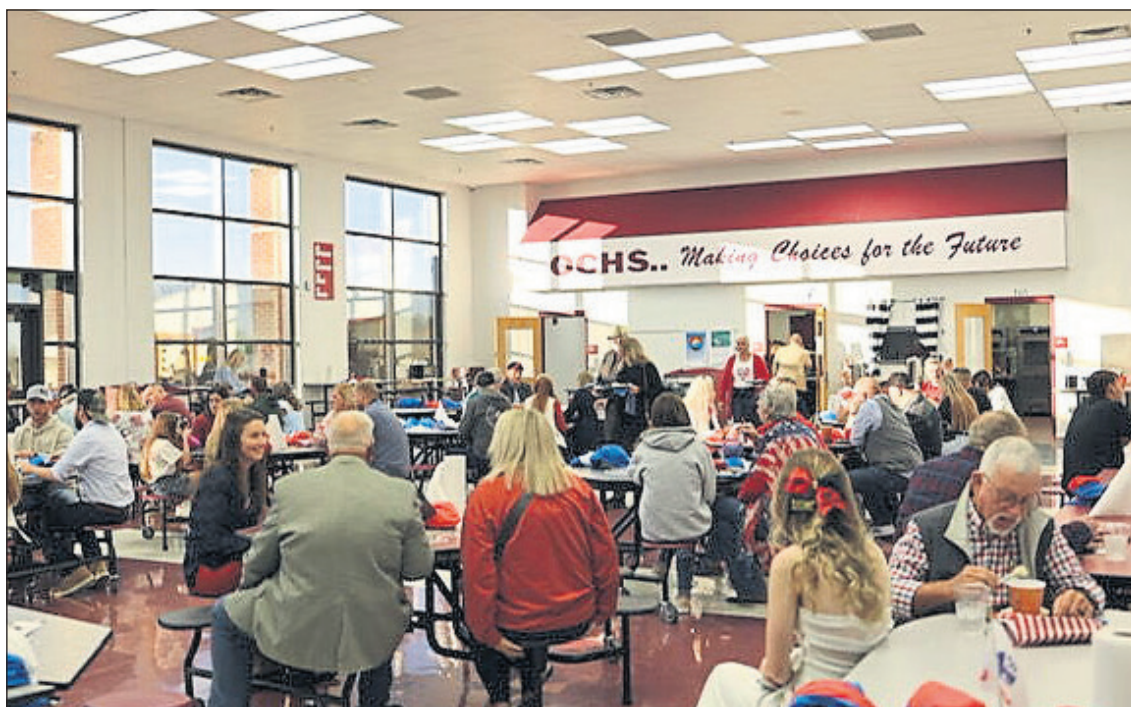
Veterans enjoy a breakfast courtesy of the Owen County Schools food services department during the Nov. 11 Veterans Day ceremony at the high school.