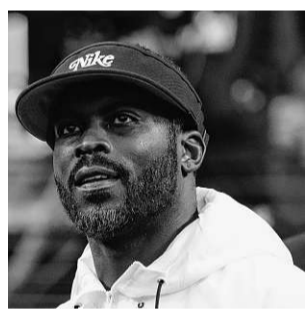
Former NFL quarterback Michael Vick said he has accepted an offer to be the football coach at Norfolk State University.

Former NFL star quarterback Michael Vick accepted an offer to become the head football coach at Norfolk State, he announced on social media. "It's an honor to announce that I'll be the new head coach of Norfolk State University," Vick wrote Tuesday on Face-