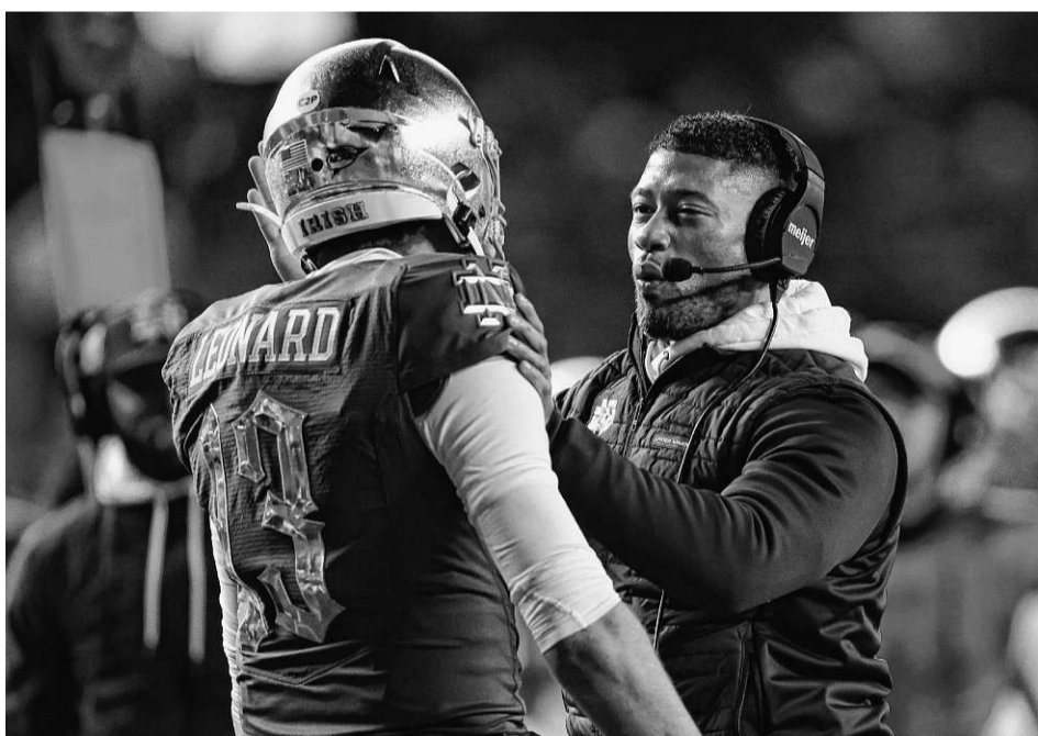
Notre Dame head coach Marcus Freeman celebrates with quarterback Riley Leonard (13) after a touchdown against Army on Nov. 23 in New York.

white, sure, but: 1. Not your marriage, you don't know. 2. It's rare to keep our own feelings out of it. If you just like the ex-husband more than the ex-wife, then at least have the self-awareness to know you aren't objective — and sit on your hands whenever you're tempted to point fingers at her to justify your sympathy for him. So, how to handle this, you ask. Based on the information given, the ex-husband was more out of line; nevertheless, you've decided not to penalize him as the ex-wife has insisted. Yes? If I read that correctly, then here's my advice: You can say this! To the ex-wife. Or your wife does, whoever is on the spot. Owning it is kinder and braver than trashing the ex-wife as some kind of rampaging harpy: "Both you and [ex-husband] are our friends. We don't condone what [ex-husband] did to you. But we're also not ending our friendship with him. "That means we're including [side piece], because they're engaged. We also will include you in everything. This is hard, but we love you and are committed to figuring it out."