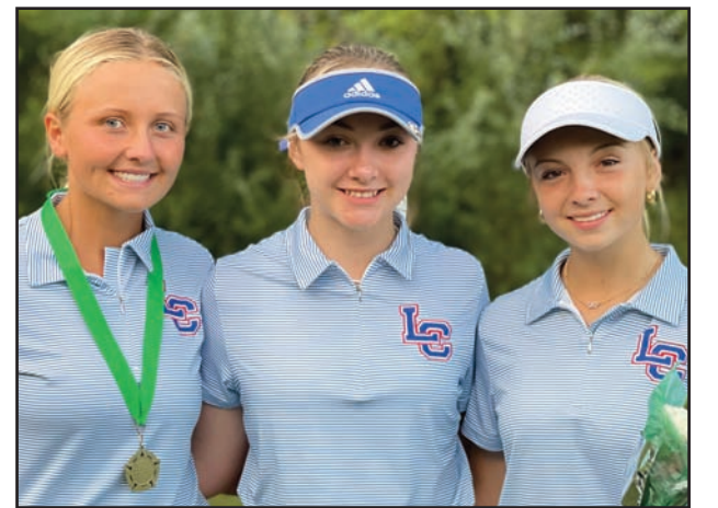
LEWIS COUNTY HERALD

The Korner would like to congratulate the ladies of the LCHS golf team on a great season and want to