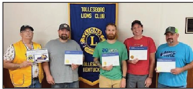
LEWIS COUNTY HERALD