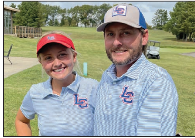
LEWIS COUNTY HERALD

Sportstumper: Who was the last person to play and manage at the same time for the Cincinnati Reds?