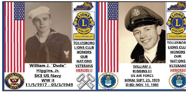
LEWIS COUNTY HERALD