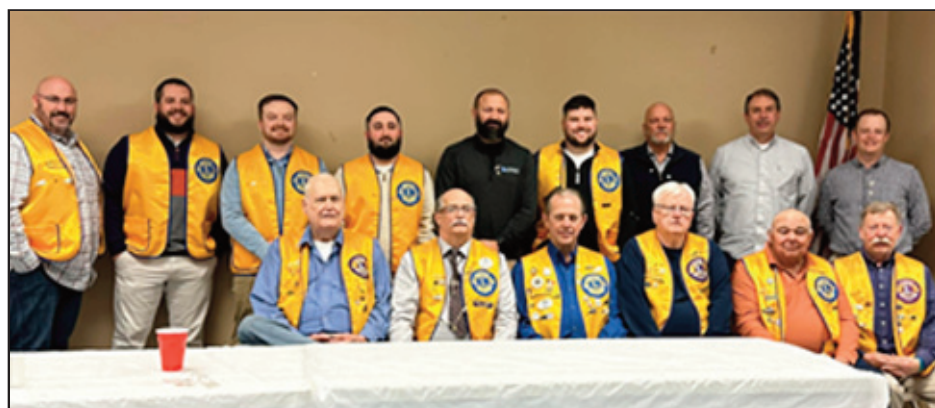
LEWIS COUNTY HERALD

The evening ended with everyone discussing our future and how we can make a difference in our community. The Vanceburg Lions Club encourages everyone to find ways to make a difference in their community and if you would like to find ways to help, let us know.