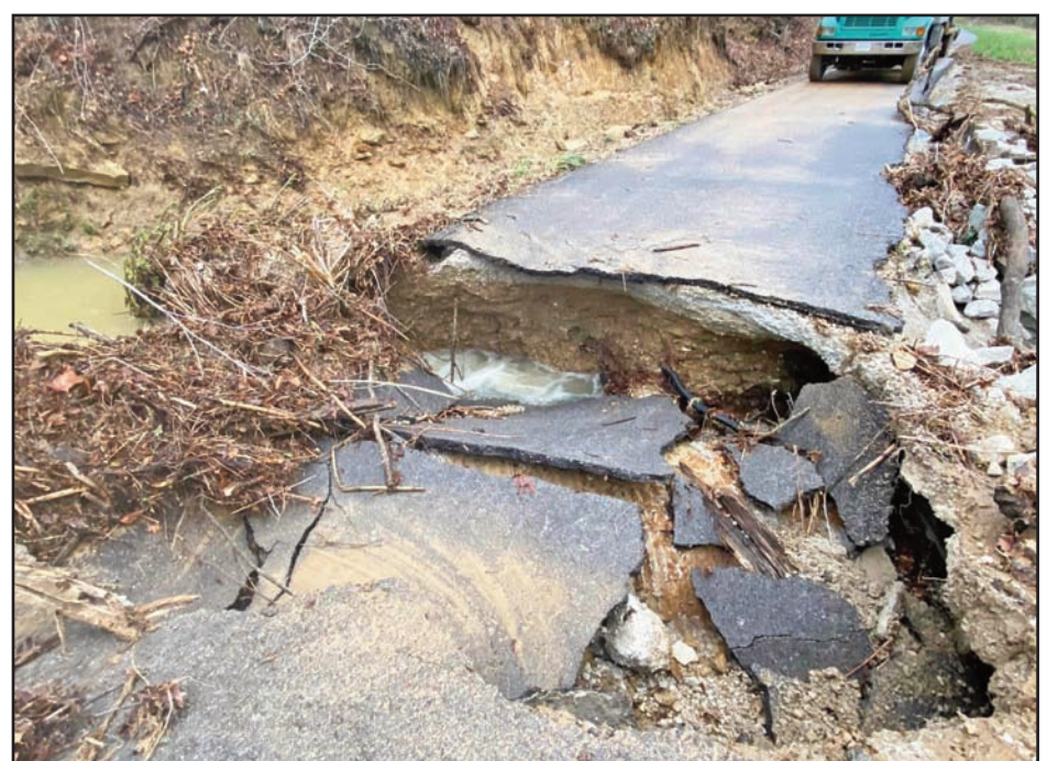
Heavy rain from storms moving throughout the area last week resulted in damage in portions of the county and across the state. Raccoon Branch Road was one of the roadways damaged in the event.

crimes with public health implications for every person in the Commonwealth of Kentucky as a victim/survivor or as a family member, significant other, neighbor, or co-worker of a victim/survivor; and WHEREAS, with leadership, dedication, and encouragement, there is evidence that we can be successful in preventing sexual violence and human trafficking in the Commonwealth through increased education, awareness, and community involvement; and WHEREAS, Kentucky's Regional Rape Crisis Centers have led the way in the Commonwealth in addressing sexual violence by working to prevent sexual violence while providing a full array of services to those who've been affected by sexual violence; and last year, Kentucky's regional rape crisis centers responded to over 3,800 crisis calls, provided more than 20,000 counseling sessions, performed over 6,000 advocacy services, and provided over 2,900 educational programs for over 95,000 Kentuckians; and WHEREAS, Kentucky's Regional Rape Crisis Centers have set an important example of how forging collaborative relationships between service agencies, organizations, and community Please see page 8