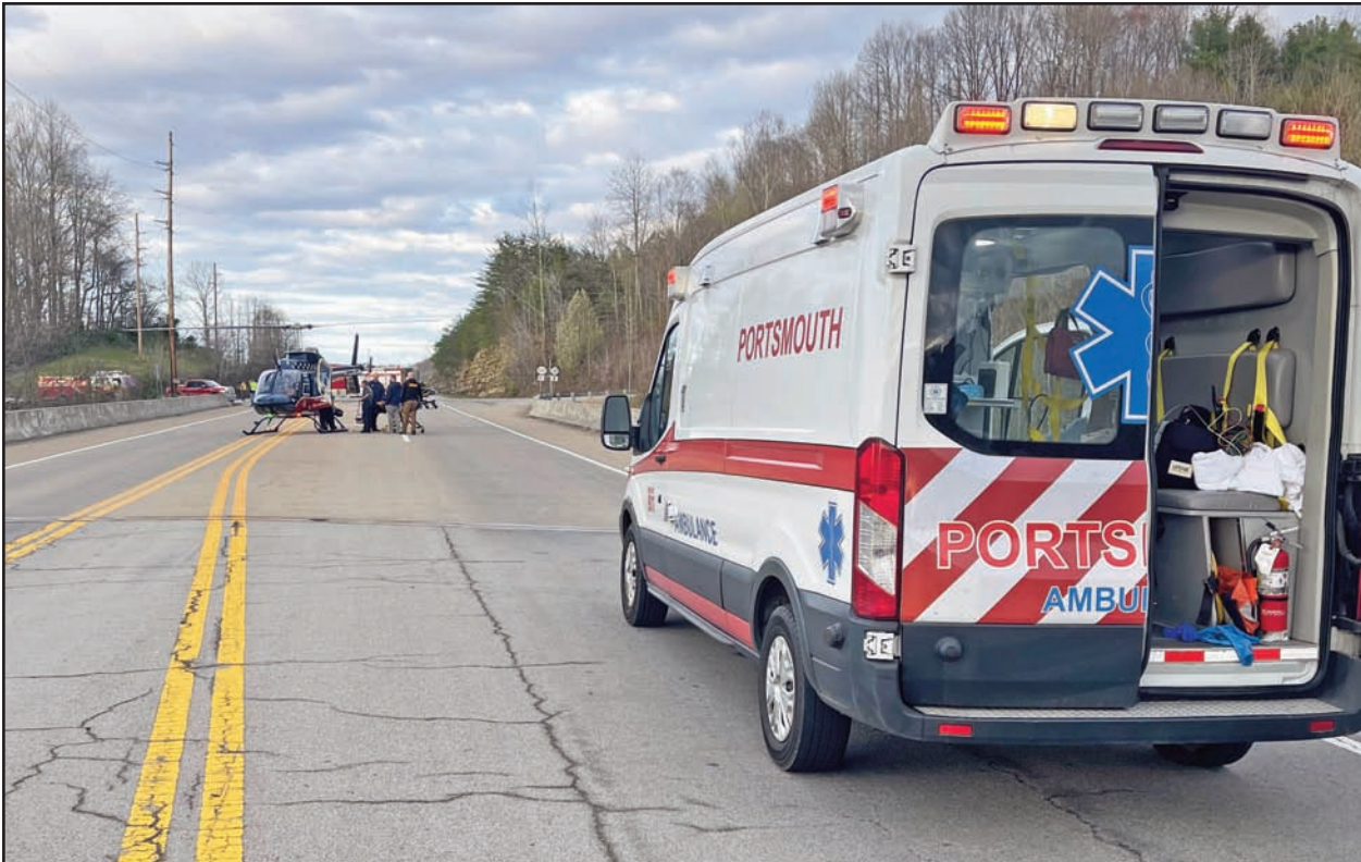
An Air Evac medical transport helicopter and Portsmouth Ambulance crew responded to assist following an ATV accident over the weekend in the Garrison area. The AA Highway was closed for a short period while the stretch of roadway was utilized for a landing zone for the helicopter.

75¢ Volume 101 The Only Newspaper Published in Lewis County Vanceburg, Kentucky Phone 606-796-2331 TUESDAY, APRIL 9, 2024 NUMBER 2024-15