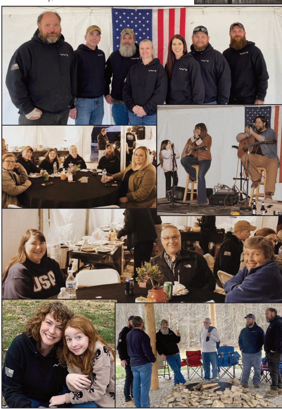
Lewis Countians enjoying the dinner and live music at Warrior Ridge.