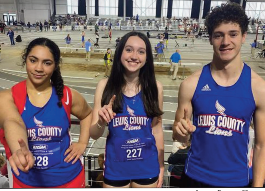
LEWIS COUNTY HERALD

So proud of these kids wait to see how she per- and what they represent. als as well!