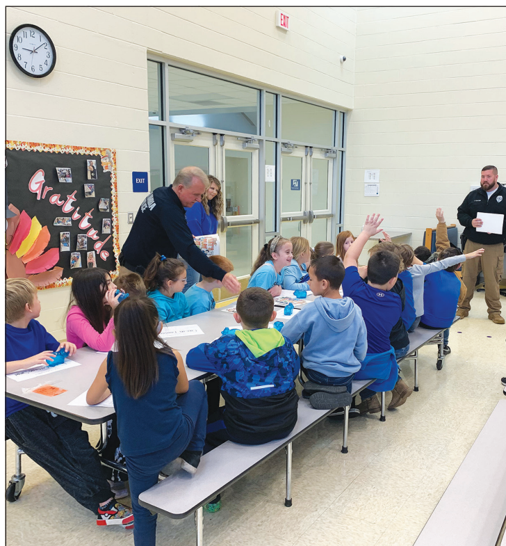
Columbia Police Officers name the students as honorary city police officers.