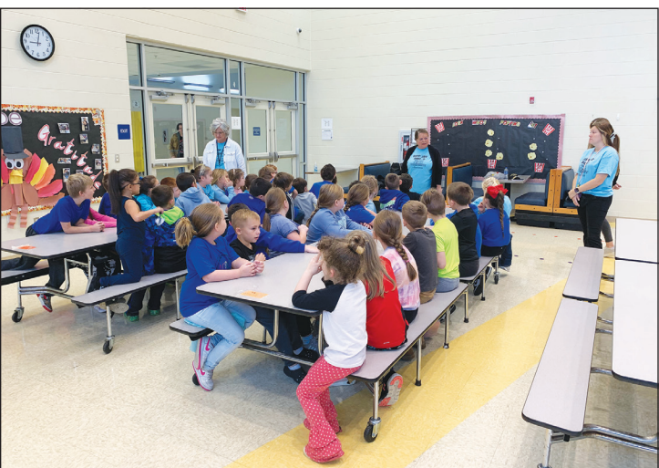
Mayor Hoots addresses the assembly at Adair County Primary Center for the proclamation of World Juvenile Diabetes Awareness Day.

Mayor Hoots added, "I am just thrilled to be able to be here today and to honor them and recognize juvenile diabetes in our community. We should all support all of these children today - and every day."